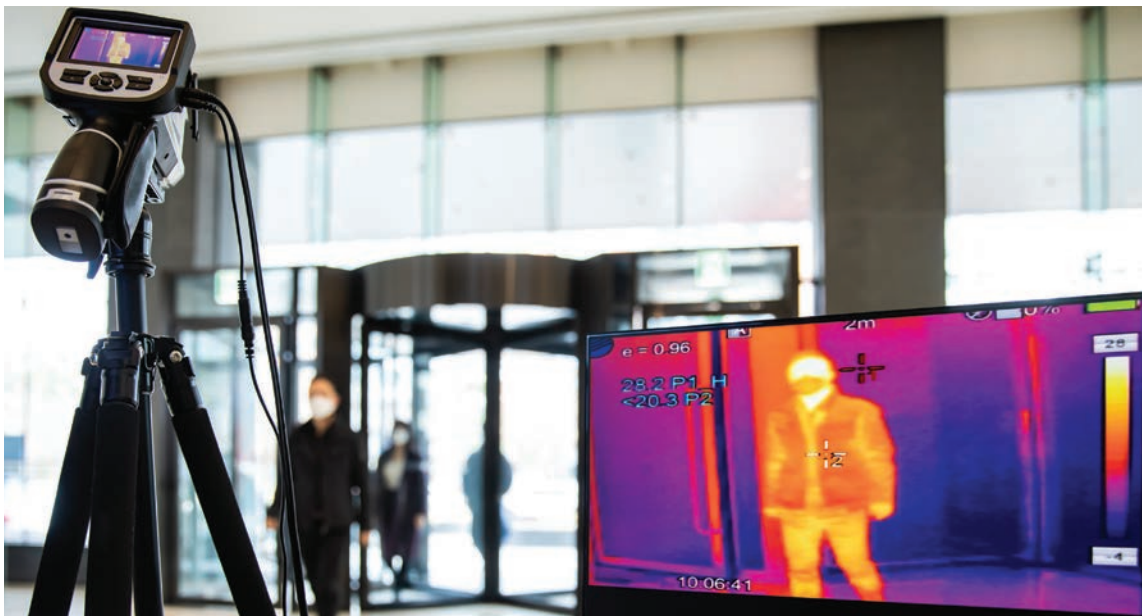
IMAGES: Attendees receive personal protective equipment according to the content of the event; Disinfecting the streets in Seoul; Thermal imaging camera is at the entrance for most business buildings.

Meetings of any size – from mega conferences of 10,000 to small incentive summits and training gatherings of fewer than 100 attendees, Destination Seoul simply makes sense. The stable democracy that is South Korea is located within easy reach of Japan, China, Taiwan and Singapore and Seoul is at the ready with a healthy selection of business and luxury hotels, a tuned up transportation system, one of the world's top international airports at Incheon and a spanking clean and vibrant city that is both safe and smart.