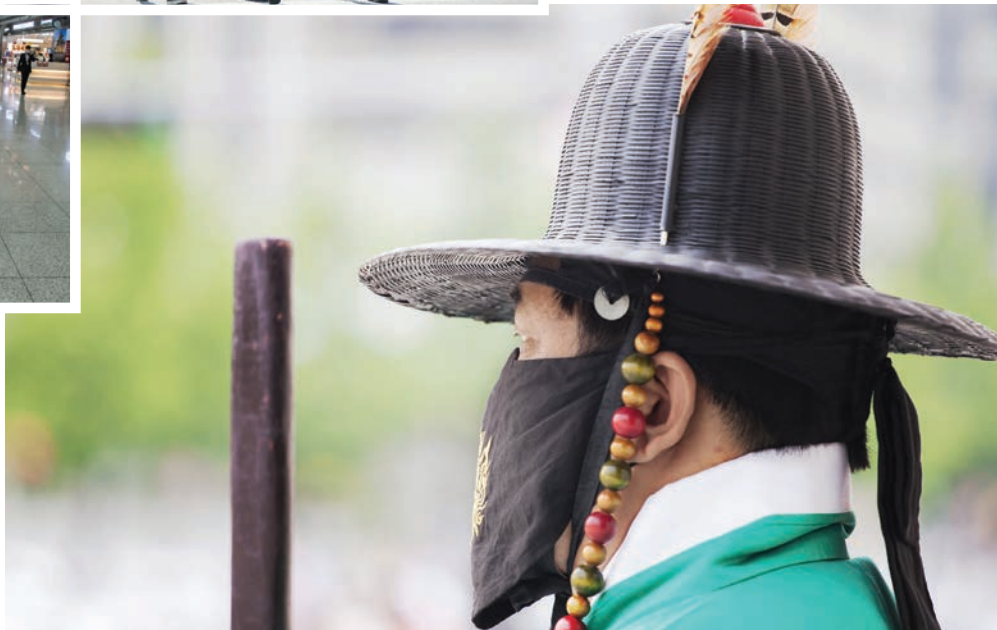
IMAGES: Most of the citizens wear a mask in public spaces; Assistant Robot with announcement about Coronavirus Covid 19 in International Airport Seoul, South Korea; Gyeongbokgung Palace, Seoul Guard in mask

that emphasizes a science-based, collective response to the pandemic, the Korean populace has been lauded for quick adoption and cooperation as protective practices continue to pivot.