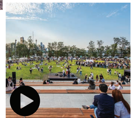
IMAGES: Cherry blossom trees at Seokchon Lake Park; Colorful city lights of Cheonggyecheon Stream Park; Nodeulseom Island is a cultural complex

is a preservation spot that features a special habitat for toads. It’s a place that can be set up for buzz-worthy meetings and seminars, or where one could come to enjoy a yoga session on the grass during a breakout session.