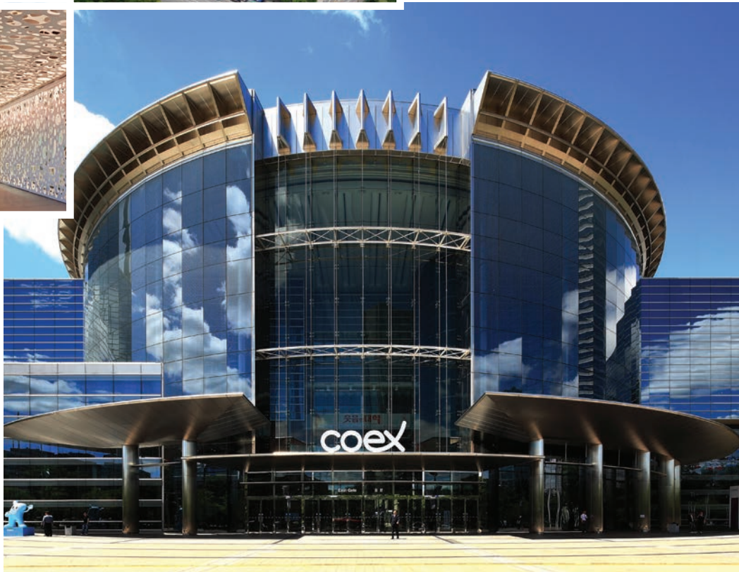
IMAGES: aT Center, equipped to hold any type of meeting; gallery hall at 63 Convention Center; Coex Convention & Exhibition Center in Gangnam district