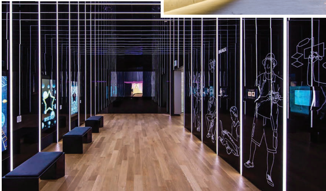
IMAGES: Entrance to Seoul City Hall offers a sense of the old and new; Futuristic travels can appeal to shoppers at Dongdaemun Design Plaza; Samsung d'light where visitors move from one environment to the next finding worlds where objects can move on their own